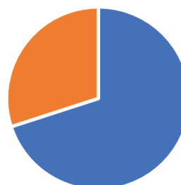
■ Left sided DCR ■ Right sided DCR

In our study, out of 50 participants, 35 left sided Dacryocystorhinostomy was performed which comprises of 70% of total sample while only 15 right sided dacryocystorhinostomy was performed which comprises of 30% of total sample.