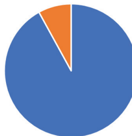
■ Primary DCR ■ Re-DCR

In our study, out of 50 participants, 4 individuals underwent Re-DCR procedure which was operated elsewhere who came to us with persistent epiphora and complete mucoid regurgitation on sac syringing that constitute of 8% of total sample while 46 participants underwent primary DCR surgery which represents 92% of total sample.