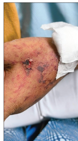
Figure 4: Eschar formation on the patient's left wrist.

dry cough but no breathlessness or chest pain. After 7 days of deteriorating despite treatment at nursing home, he took transfer to our hospital. Physical examination revealed febrile state, 101 F, pulse of 102/min regular, and blood pressure was 110/60. He was having bilateral pedal edema, with skin rashes all over the body with eschar formation on the left arm [Figure 4]. Systemic examination revealed conscious, oriented, and few cervical superficial lymphadenopathies. There was no significant hepatosplenomegaly. There were no other significant systemic abnormalities. His investigations revealed leukocytosis, thrombocytosis, increased liver enzymes with normal prothrombin time/International Normalized Ratio, hyponatremia, and high creatinine level. His tropical fever panel was normal. This includes following polymerase chain reaction (PCR) assay (dengue, chikungunya, leptospira, salmonella, Zika virus, and West Nile virus). His herpes immunoglobulin G (IgG), immunoglobulin M (IgM) antibodies were negative; Borrelia IgM was absent; scrub typhus IgM was negative; and triple (human immunodeficiency virus [HIV], hepatitis B virus,