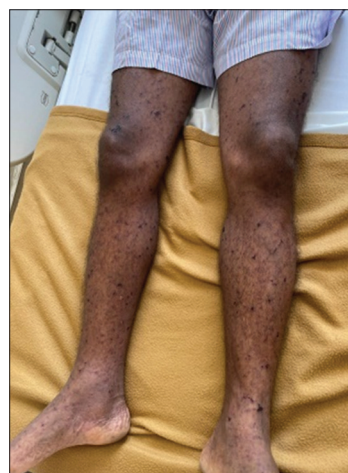
Figure 3: Generalized skin rash over trunk and back.