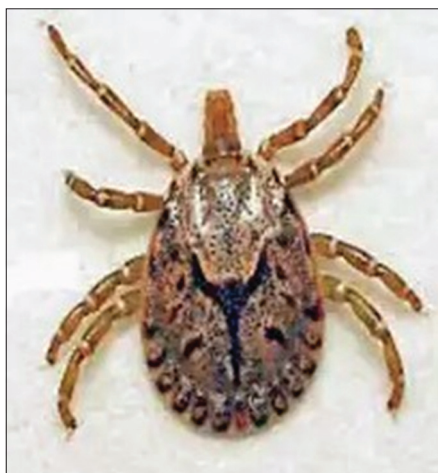
Figure 1: Image of the chigger mite ( Orientia tsutsugamushi vector).